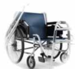
Durable Medical Equipment